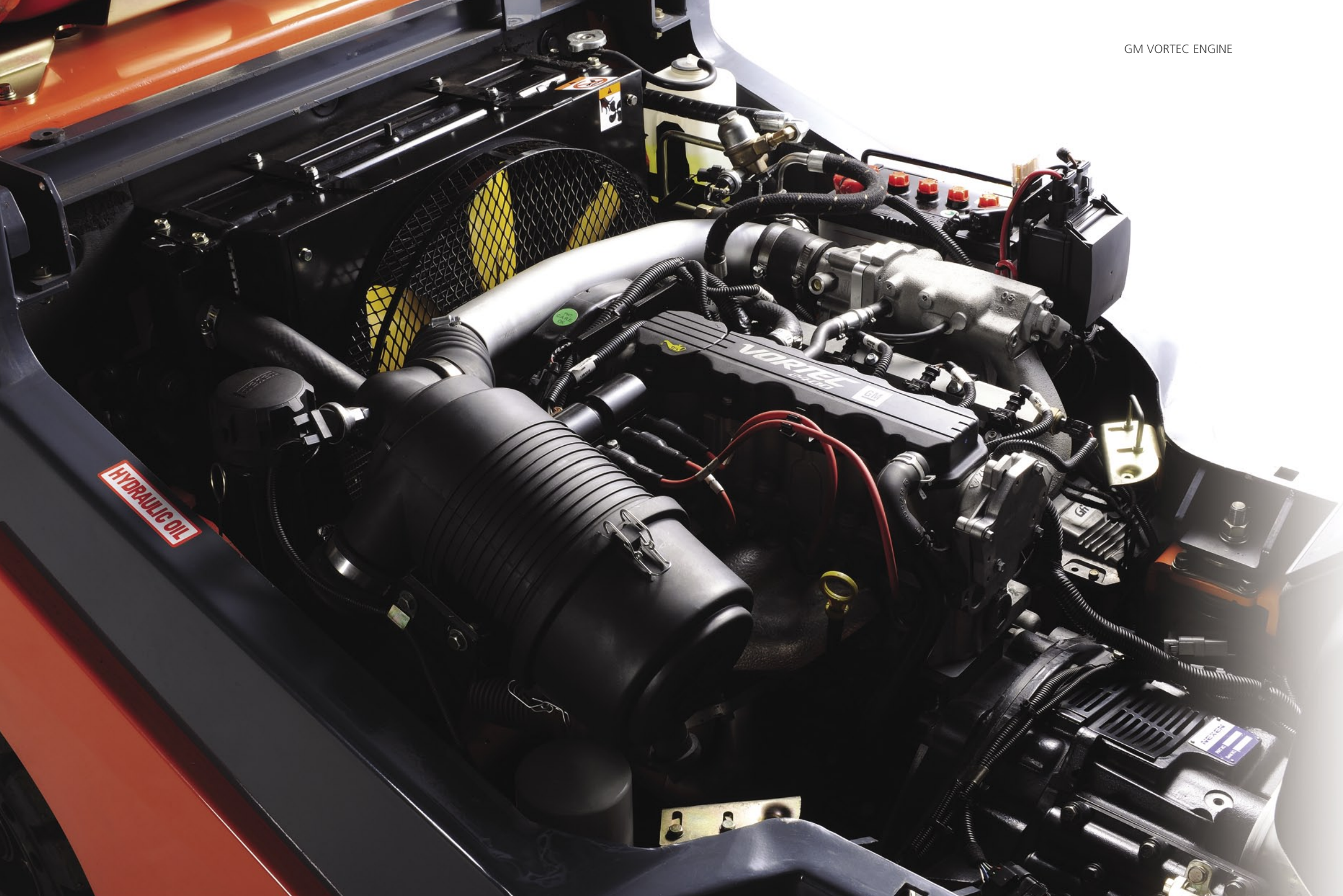
GM VORTEC ENGINE